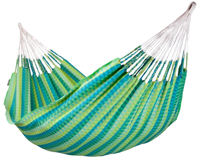
Double Hammock Carolina spring CAH16-4