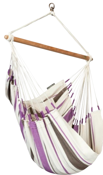
Hammock chair basic Caribeña purple CIC14-7