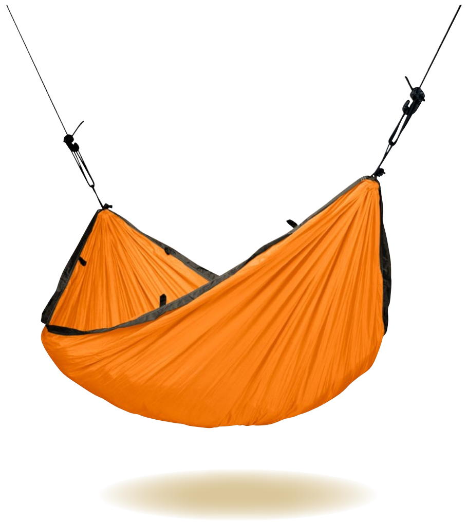
Single travel hammock Colibri orange CLH15-5