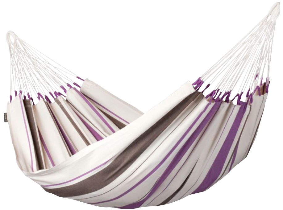
Single Hammock Caribeña purple CIH14-7