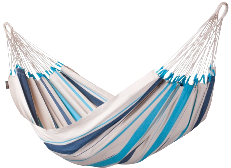
Single Hammock Caribeña aqua blue CIH14-3